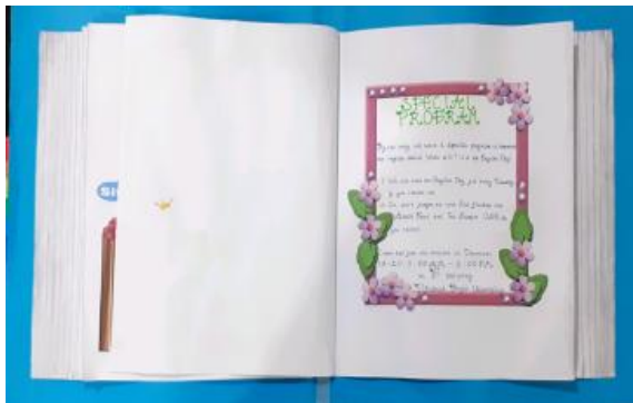
Figure 4. 3 rd Content Layout: Give More Advantage

Putting advantages (figure 3 and 4) are good idea since it will convince the reader of the content of the message. As the poster is for chairman of the campus's organization. The advantages are talking about the vision and the missions of the candidates.