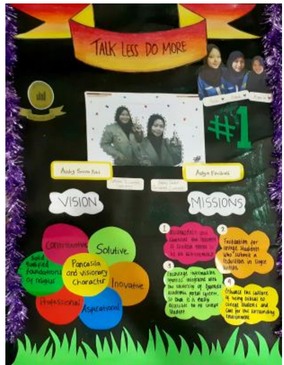
Figure 6 Headline Example: Short, Concise, and Gripping

In addition, the headline roles as a hook to lead the audience to find more the information given. However, there are some rules to make a good headline (Erren & Bourne, 2007). The first rule is defining the purpose. Headline must align with the purpose. Preparing a poster on this rule is started by questioning 'what do you want others to do?' the second rule is be concise and clear. The third is putting the title that sharp, short, and gripping. The fourth is showing the uniqueness. For example, "Talk Less Do More"