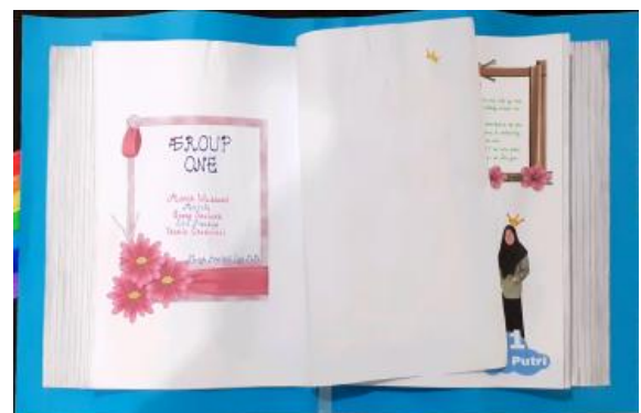
Figure 2. 1 st Content Layout: the Creator Profile

The poster above is built by putting a book with pages (fig 1). Putting logos also help readers to indicate the organization which be responsible of this poster creation. The layout is centered mode. The error of the layout is putting dark colour logo (on the top right) on black background. Though, the middle (white and blue area) seems like a book with pages. each page consists valuable information. The interesting thing of the poster is the poster are invited reader to flip the pages to find more