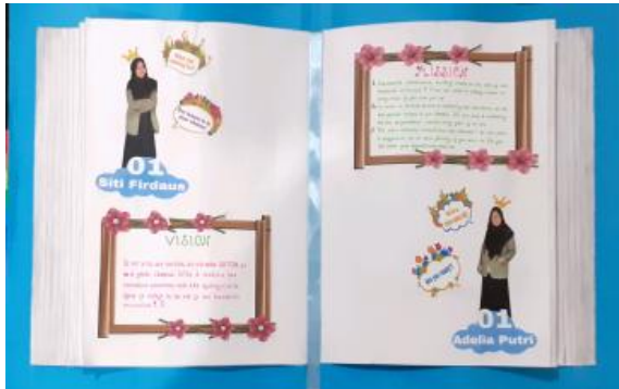
Figure 3. 2 nd Content Layout: Give the Advantage

On Figure 2, putting identity in a poster is a must since the readers will easily find who is/are responsible on the message given.