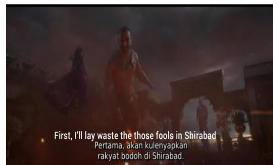
Figure 10 Jafar is talking to Aladdin (At the palace 18:01 – 16:07)

Philautiais love ourselves. It can be healthy or unhealthy for us. Philautia can categorize into the unhealthy love if we are feeling hubris and we feels like the God. Hubris has come to mean an inflated sense of position, abilities, or accomplishment.