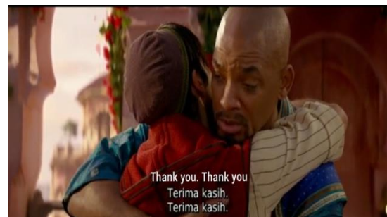
Figure 5 Genie is talking to Aladdin (0:12:59 – 0:11:48)

Philia is about friendship. The best kind of friendship is when give our love to all of best friend.