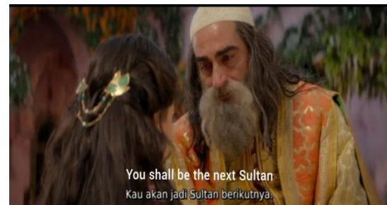
Figure 1. Sultan is talking to Jasmine (0:10:32 – 0:9:48)

Trust is the most basic foundation of love. And trust in any condition about the problems.