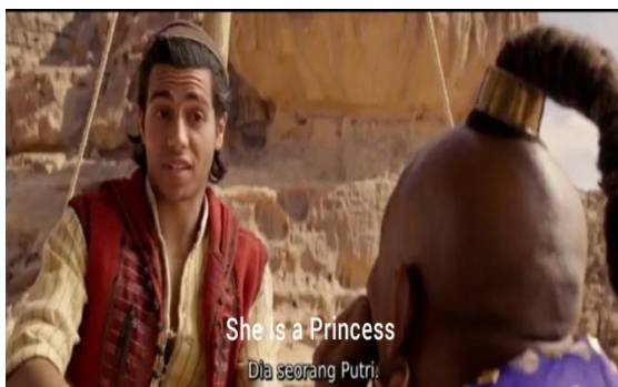
Figure 9 Aladdin is talking to Genie (1:17:52 – 1:16:45)

Pragmais a kind of practical love founded on reason or duty and one’s longer term interests.