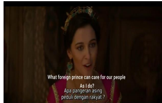
Figure 7 Sultan is talking to Jasmine and Jafar (1:45:58 – 1:45:32)

Agape is universal love, such as the love for strangers, nature, and God. Unlike storge, it does not depend on the filiation or familiarity.