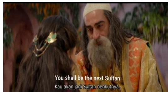
Figure 1. Sultan is talking to Jasmine (0:10:32 – 0:9:48)

Trust is the most basic foundation of love. And trust in any condition about the problems.