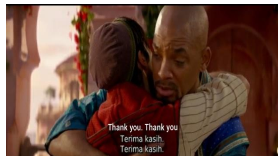
Figure 5 Genie is talking to Aladdin (0:12:59 – 0:11:48)

Philia is about friendship. The best kind of friendship is when give our love to all of best friend.