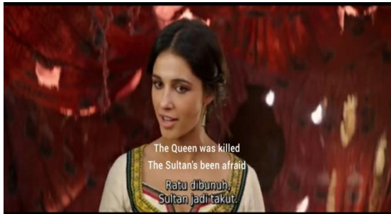
Figure .6 Jasmine is talking to Aladdin (1:52:56 – 1:52:30)

Storge is kind of love between parents and children. It explains about naturalness of love that comes from our deep heart.