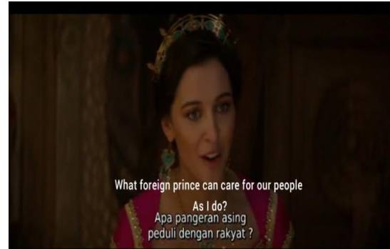
Figure 7 Sultan is talking to Jasmine and Jafar (1:45:58 – 1:45:32)

Agape is universal love, such as the love for strangers, nature, and God. Unlike storge, it does not depend on the filiation or familiarity.