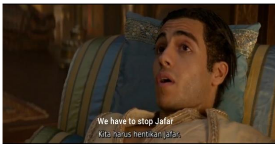
Figure 3 Aladdin is talking to Genie (0:42:02 – 0:41:20)