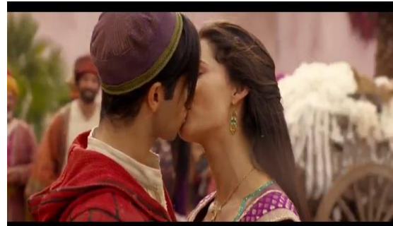
Figure.4 Aladdin kiss Jasmine(0:8:5 – 0:8:42)

Eros is sexual or passionate love, and this is a type of modern construct of romantic love.