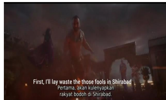
Figure 10 Jafar is talking to Aladdin (At the palace 18:01 – 16:07)

Philautiais love ourselves. It can be healthy or unhealthy for us. Philautia can categorize into the unhealthy love if we are feeling hubris and we feels like the God. Hubris has come to mean an inflated sense of position, abilities, or accomplishment.