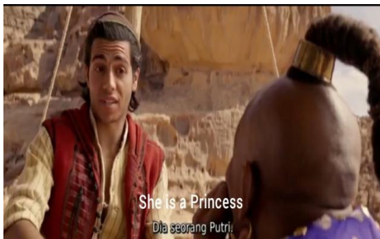
Figure 9 Aladdin is talking to Genie (1:17:52 – 1:16:45)

Pragmais a kind of practical love founded on reason or duty and one’s longer term interests.