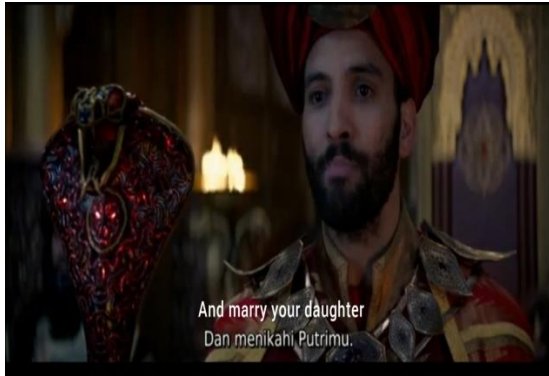
Figure 8 Jafar is talking to Sultan and Jasmine

(0:24:11 – 0:23:54) Jafar : “No. What you need, Baba, is to suffer. Like I have suffered.” Jasmine : “Baba?” Jafar : “Watching me rule your kingdom be enough?” Jasmine : “Stop!” Jafar : “But, watching my armies devour your toothless allies....” Jasmine : “Please, make it stop!” Jafar : “No, the most suitable punishment would be to make you watch, while I take what you love most.” Sultan : “No!” Jasmine : “Baba!” Jafar : “And marry your daughter.” Dali : “No!” Sultan : “She will never marry you.” Jafar : “(Hurt the sultan)” Jasmin : “No! I will do as you wish ! Make it stop! Make it stop.”