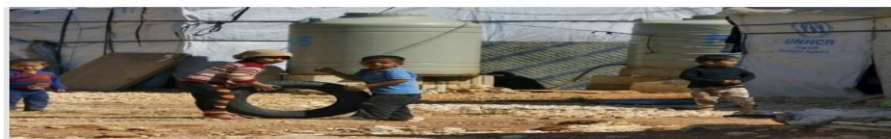
UN says 43 percent of Syrian refugee children are out of school

An entire generation of Syrians has lost the opportunity of getting an education because of the war.