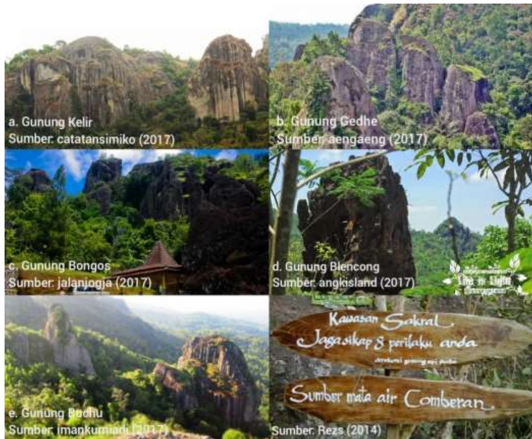
Figure 1. Gunung Api Purba Attraction